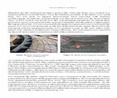
Figure 10. Wire mesh to support ferro-cement layer

Bamboos for the structural members used in the vault and dome were treated in a solution of boric acid and borax. Over the bamboo assembly in the dome, wire mesh (Fig. 10) was used to support ferro-cement layer provided with nominal reinforcement. Membrane waterproofing was then provided over the ferro-cement layer. A PVC board was fixed over the waterproofing membrane on which three geotextile layers were provided for irrigation assembly and the plants. Copper pipes having nozzles (Fig. 11) were inserted inside upper two geotextile layers to irrigate the plants. Tree of Life was then made on the top of the dome from copper sheet and in the remaining portion ornamental plants were planted except in the area where solar panels were installed. To showcase energy efficiency, few solar panels were installed on the roof and a small wind mill provided in the central portion.