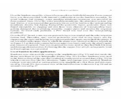
Figure 23. Bamboo false ceiling