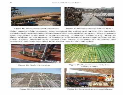
Figure 17. Reinforcement for bamboo beams

Figure 16. Fixing arrangement of bamboos