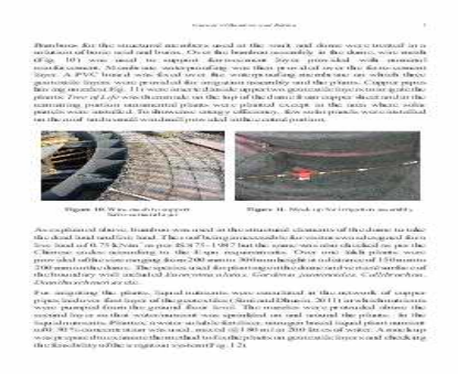
Figure 11. Mock up for irrigation assembly

As explained above, bamboo was used in the structural elements of the dome to take the dead load and live load. The roof being inaccessible for visitors was designed for a live load of 0.75 \text{ kN/m}^2 as per IS 875- 1987 but the same was also checked as per the Chinese codes according to the Expo requirements. Over one lakh plants were provided of the size ranging from 200 mm to 300 mm height at a distance of 150 mm to 200 mm on the dome. The species used for planting on the dome and vertical surface of the boundary wall included Euonymus alatus , Gardenia jasminoides , Callibrachoa , Dianthus chinensis etc.