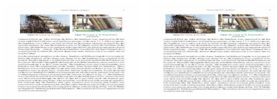
Figure 14. A mock up for dome