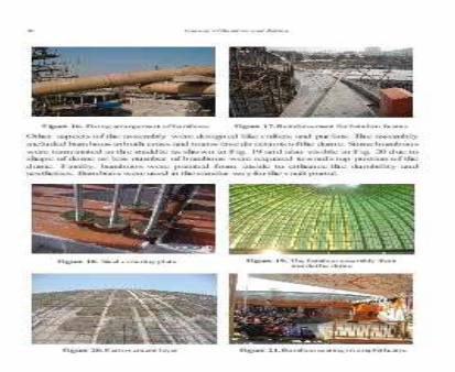
Figure 16. Fixing arrangement of bamboos