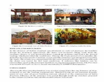
Figure 26. An external view of India Pavilion