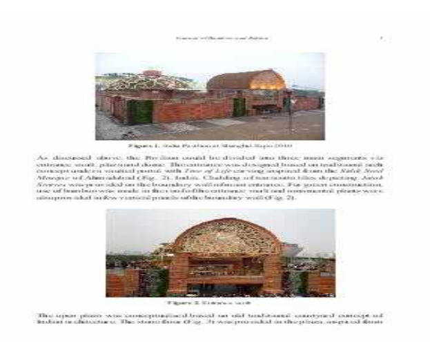
Figure 1. India Pavilion at Shanghai Expo 2010

As discussed above, the Pavilion could be divided into three main segments viz entrance vault, plaza and dome. The entrance was designed based on traditional arch concept under a vaulted portal with Tree of Life carving inspired from the Siddi Syed Mosque of Ahmadabad (Fig. 2), India. Cladding of terracotta tiles depicting Jatak Stories was provided on the boundary wall of main entrance. For green construction, use of bamboo was made in the roof of the entrance vault and ornamental plants were also provided in few vertical panels of the boundary wall (Fig. 2).