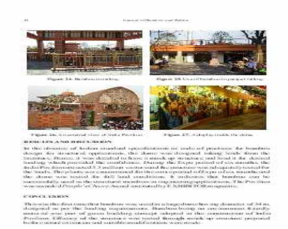
Figure 24. Bamboo in railing