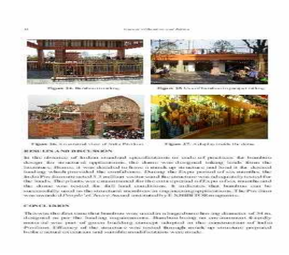
Figure 27. A display inside the dome