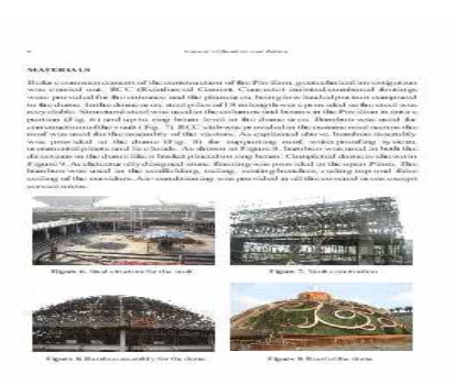
Figure 8. Bamboo assembly for the dome