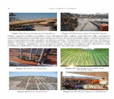
Figure 18. Steel covering plate

Other aspects of the assembly were designed like rafters and purlins. The assembly included bamboos in both cross and transverse directions of the dome. Some bamboos were terminated in the middle as shown in Fig. 19 and also visible in Fig. 20 due to shape of dome as less number of bamboos were required towards top portion of the dome. Finally, bamboos were painted from inside to enhance the durability and aesthetics. Bamboos were used in the similar way for the vault portal.