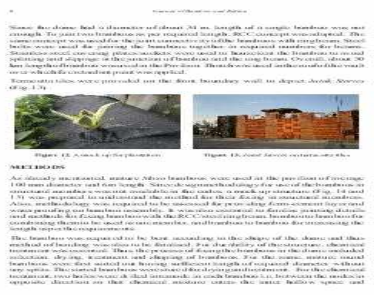
Figure 13. Jatak Stories on terracotta tiles