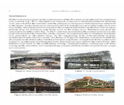
Figure 9. Roof of the dome