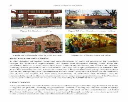
Figure 25. Use of bamboo in parapet railing