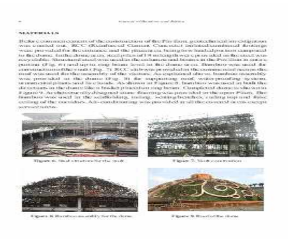
Figure 7. Vault construction