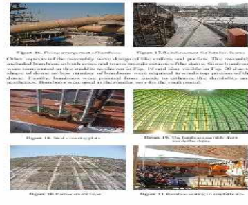
Figure 20. Ferro-cement layer