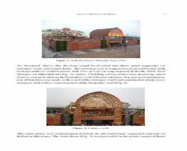
Figure 2. Entrance vault

As discussed above, the Pavilion could be divided into three main segments viz entrance vault, plaza and dome. The entrance was designed based on traditional arch concept under a vaulted portal with Tree of Life carving inspired from the Siddi Syed Mosque of Ahmadabad (Fig. 2), India. Cladding of terracotta tiles depicting Jatak Stories was provided on the boundary wall of main entrance. For green construction, use of bamboo was made in the roof of the entrance vault and ornamental plants were also provided in few vertical panels of the boundary wall (Fig. 2).