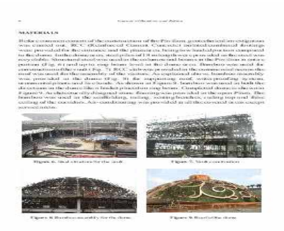
Figure 6. Steel structure for the vault

Before commencement of the construction of the Pavilion, geotechnical investigation was carried out. RCC (Reinforced Cement Concrete) isolated/combined footings were provided for the entrance and the plaza area, being low loaded portion compared to the dome. In the dome area, steel piles of 18 m length were provided as the steel was recyclable. Structural steel was used in the columns and beams in the Pavilion in entire portion (Fig. 6) and up to ring beam level in the dome area. Bamboo was used for construction of the vault (Fig. 7). RCC slab was provided in the commercial area as the roof was used for the assembly of the visitors. As explained above, bamboo assembly was provided in the dome (Fig. 8) for supporting roof, waterproofing system, ornamental plants and live loads. As shown in Figure 8, bamboo was used in both the directions in the dome like a basket placed on ring beam. Completed dome is shown in Figure 9. Architecturally designed stone flooring was provided in the open Plaza. The bamboo was used in the scaffolding, railing, seating/benches, railing top and false ceiling of the corridors. Air-conditioning was provided in all the covered areas except service areas.