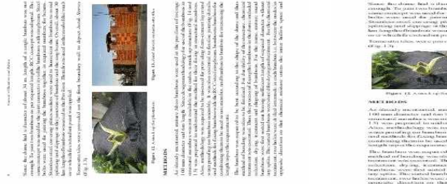
Figure 12. A mock up for plantation

Terracotta tiles were provided on the front boundary wall to depict Jatak Stories (Fig. 13).