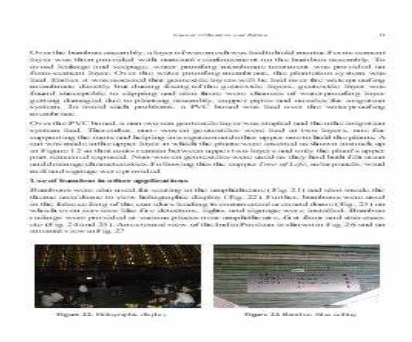
Figure 22. Holographic display

Bamboos were also used for seating in the amphitheatre (Fig. 21) and also inside the theme area/dome to view holographic display (Fig. 22). Further, bamboos were used in the false ceiling of the corridors leading to commercial area and dome (Fig. 23) on which even services like fire detectors, lights and signage were installed. Bamboo railings were provided at various places near amphitheatre, first floor and staircases etc (Fig. 24 and 25). An external view of the India Pavilion is shown in Fig. 26 and an internal view in Fig. 27.