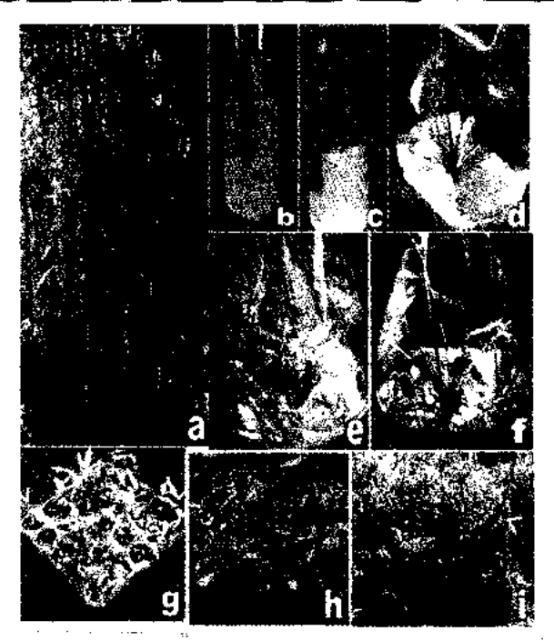
Figure 1. Micropropagation and hardening of B. nutans plantlets, a: mother clump; b: inocultion of explants on MS semi-solid medium supplemented with 10 \mu MBA + 0.1 \mu MIAA; c: bud break; d: excision and transfer of sprouted axillary buds on MS liquid medium + 10 \mu MBA + 0.1 \mu MIAA; e: shoot multiplication on MS liquid medium + 31.06 \mu MBA + 2.85 \mu MIAA; f: rooting on MS liquid medium + 25 \mu MIBA after nine weeks; g: transfer of plantlets of root trainers; h: shadehouse acclimatized plantlets in polybags; i: plantlets after six months growth in polybags.