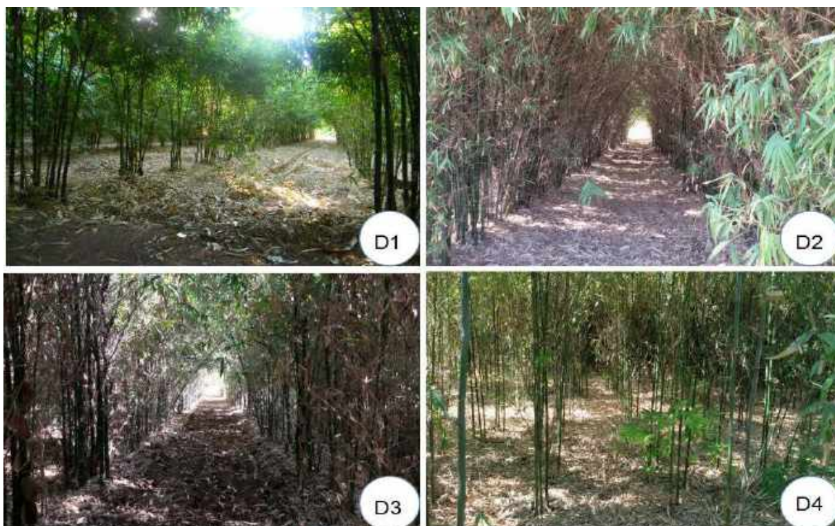
Fig 2. Bamboo growth at different densities of agronomical plantation plots

Plant growth parameters were recorded annually up to four years for B. balcooa plants in all cultivation densities (D1, D2, D3 and D4) as shown in Table 1. Survival rate for the B. balcooa at all densities were close to 100% except D4 (97.66%) at the end of fourth year. All the parameters except the total number of culms/ha decreased with respect to increase plant densities for all four years. All the parameters increased with increase in age post planting for all plant densities. D1 had the highest fresh and dry weight ( 159.87 \pm 0.061 kg/