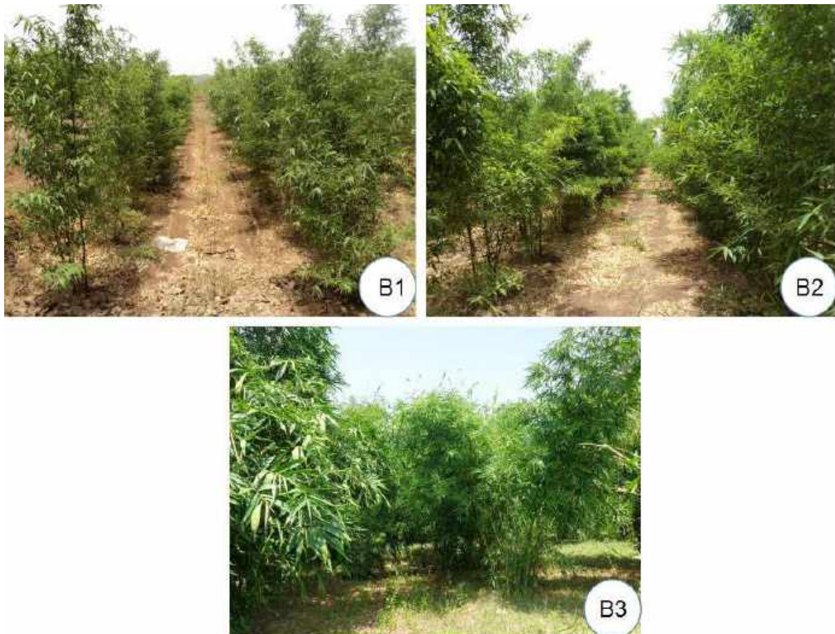
Fig 3. Farmers' field bamboo cultivation

mu, & Sureshkumar, 2016). Correlation analysis (Table 3) also confirms an inverse relationship as higher the plantation densities lower the biomass yield. At the end of fourth year, gradual decrease with increase in the plantation density of B. balcooa was noticed while for each individual cultivation density B. balcooa showed a significant increase in the clump girth at base & 3 rd internode height. Standing culm density is also an important parameter to judge the biomass productivity in bamboo (Volkar & Devid, 2001). The number of culms in B. balcooa cultivation increased significantly ( p < 0.0001 ) for each density with respect to years after plantation (Table 1). Optimum standing-culm density in bamboo varies with species and geographic location. Bamboos with smaller diameter (1-4 cm) like species P. nigra and P. niduaria have much higher standing-culm density (Shen, Fan, Liu, Chen & Li, 1993), than bamboos with medium diameter (4-5 cm) like species P. makinoi (Yang & Huang, 1981) and lower in bigger diameter (8-18 cm) in P. pubescens (Dart, 1999; Liao, 1986).