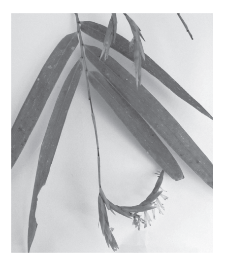
Figure 1. A branch of S. dullooa bearing inflorescence

The inflorescence of S. dullooa is a large panicle. The spikelets were dichogamous, protogynous and open. The occurrence of protogyny was confirmed by the presence