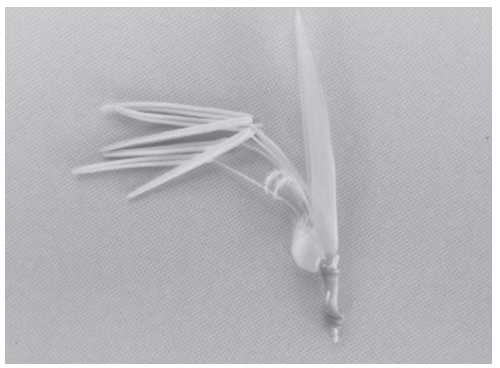
Figure 3. The steeple like appendages seen on the S. dullooa florets