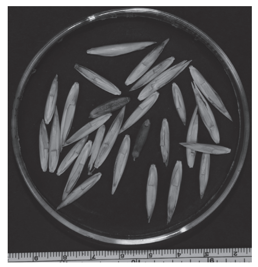
Figure 5. S. dulloa seed

leafless, the top portion already dried and flowering was continuing in the bottom portion of the culms. Bottom portion also showed the symptoms of drying. Production of new shoots occurred in the clump during reproductive phase also. The new culms produced during 2010 (May-June) had an average girth of 6-7 cm and 5.2 m height (almost half the size of previous emerged culms). In May- June, 2011, seven new culms were produced (3 m height and 3.8 cm girth). Twenty more thinner culms were produced during September (3 m height and 3 cm girth). It may be concluded that, even though culm production occurs during reproductive phase, the culm size reduced substantially.