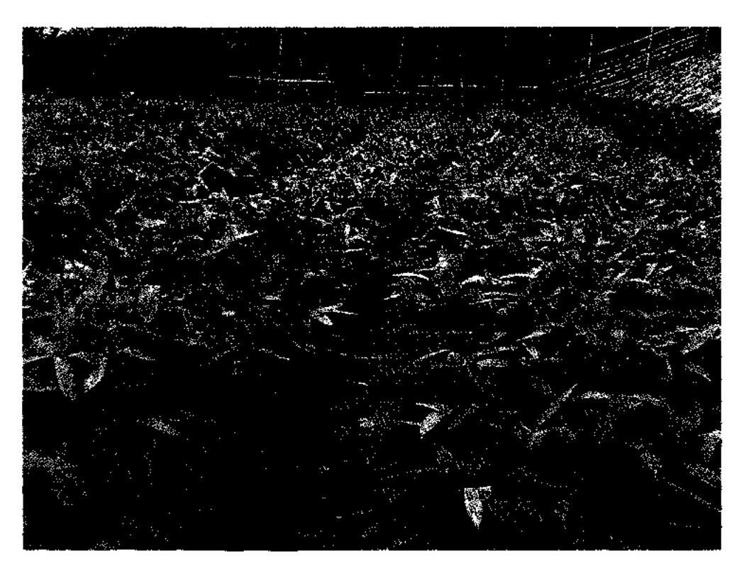
Figure 3. Seedlings of O. travancorica

Seedlings of both M. baccifera and O. travancorica contained high moisture. On an average, at the end of the observation period (180 days) the moisture contents of the leaves, shoot, root and rhizome of the former were 168.25, 253.61, 359.25 and 559.33 per cent respectively and 212.84, 288.27, 283.10 and 440.32 per cent respectively for the latter (Fig. 4).