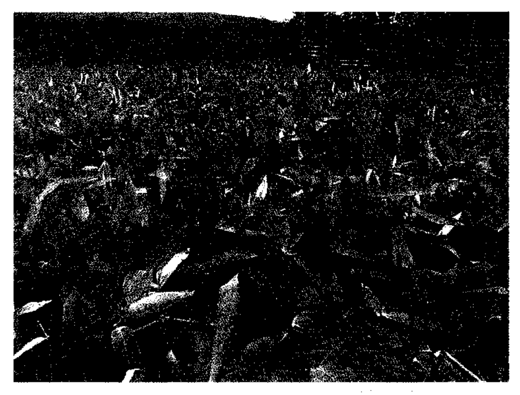
Figure 2. Seedlings of M. baccifera

One per cent of the seedlings of M. baccifera was albinos. Two types, complete white and white with green stripes were observed among albino seedlings (Fig. 2). Some of the latter turned to green within a period of one month. Occurrence of albino seedlings was less than 0.5 per cent in O. travancorica (Fig. 3).